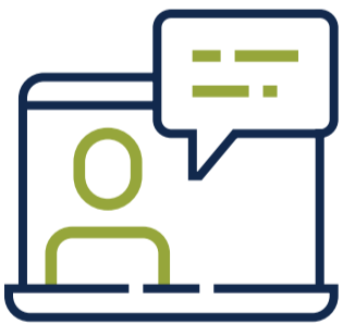
AGENT-LED VIDEO CHATS