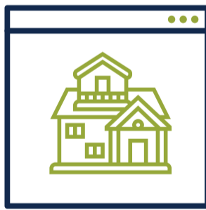
HIGH-QUALITY PHOTOS AND DETAILED LISTINGS