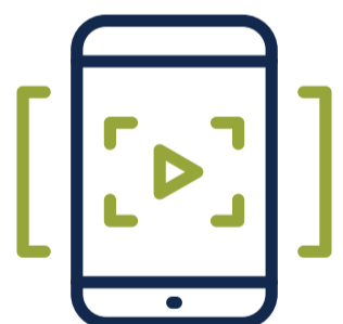
VIRTUAL HOME TOURS